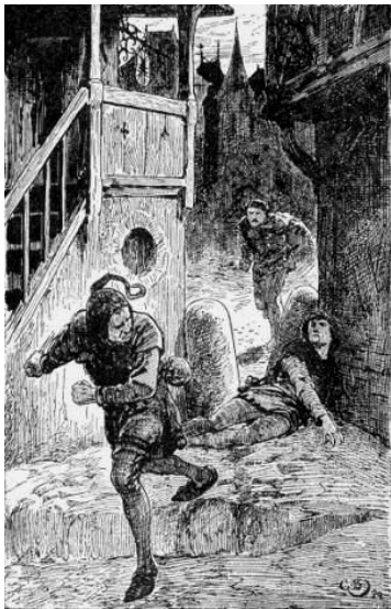
Attempted Assassination of Sir Walter.