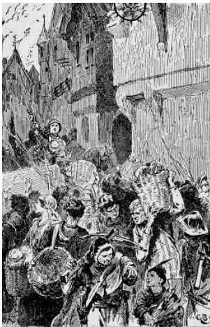
The Citizens Prepare to Defend Hennebon.--Page 140.

Absorbed in their work, none had time to think of the dangers which threatened them, and a stranger would rather have thought from their cheerful and animated countenances that they were preparing for a great fête than for a siege by an army to which the two chief towns in Brittany had succumbed.