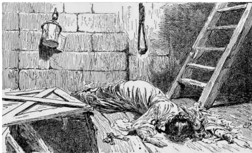
Lady Edith's Last Effort.--Page 321.

Walter now mounted; Ralph took his place on one side of him, and one of his tenants on the other, lest he should be seized with faintness; then at a hand-gallop they started back for the castle.