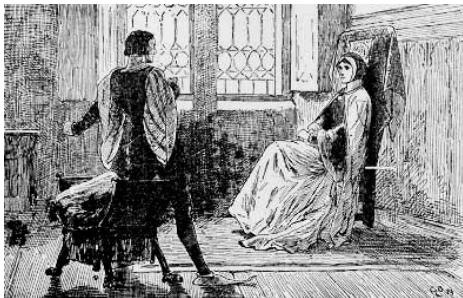
Dame Alice Reveals Sir James' Villainy.--Page 187.

The knight leaped from his seat with a fierce exclamation. "This is too much," he exclaimed, "and I have a right to know why such an offer on my part should be answered by disdain, and even insolence."