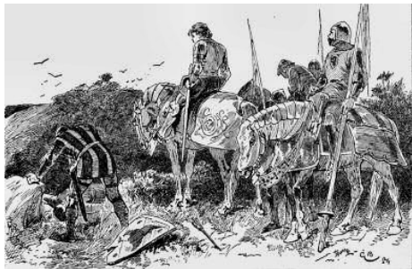
The end of a Recreant Knight.--Page 386.

"Take off his helmet, Ralph. Let me see his face. Methinks I recognized his voice, and he fought as if he knew and hated me."